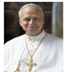
Gen. P.P. XIV

For prayer with the Word of God; Let us pray that praying with the Word of God be nourishment for our lives and a source of hope in our communities, helping us to build a more fraternal and missionary Church.